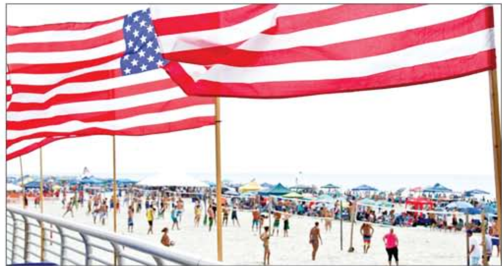
THOUSANDS OF PLAYERS and spectators turned out for the annual event.